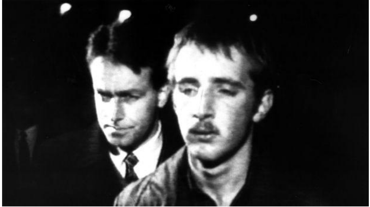
Scenes from the shooting in Hoddle Street in 1987.

But there were other heavyweights who didn't warm to him. In 1993 prison authorities discovered a mass escape plot involving up to 30 inmates in Pentridge's notorious H Division. The plan included attacking Knight in his cell.