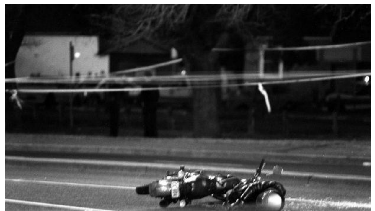
Hoddle Street: a victim lies on the road.

In just 38 minutes the 19-year-old failed (and bullied) army officer candidate fired 200 rounds of high-grade ammunition, killing seven people, wounding a further 19 and nearly shooting the police helicopter out of the sky.